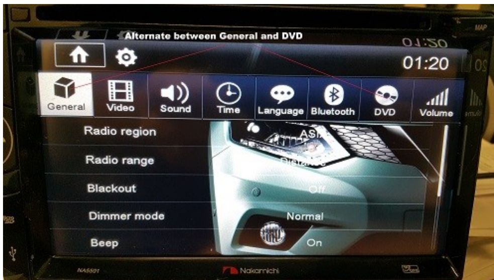
ALTERNATE BETWEEN GENERAL AND DVD

Once your in the factory mode scroll up until you see UPDATE LOGO YES tap on it, it might take 2 or 3 goes to go to the next update logo screen, once your on the logo screen you then choose your slash screen picture and Tap on Update LOGO if it was done correctly it should say UPDATED SUCCESSFUL. Turn the unit OFF and turn it back ON again you should see you splash screen booting up with your logo or picture.