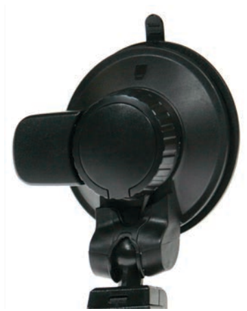
Mounting Bracket with Charger