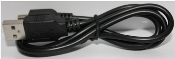
USB to Mini USB