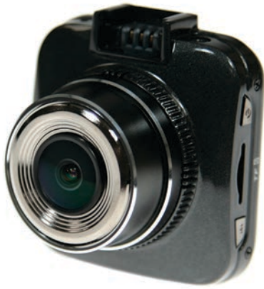
HD DVR 550