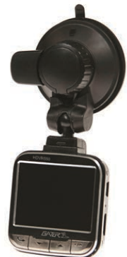
HD DVR 550 User Guide