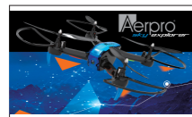
App home screen